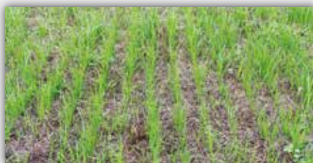
During Vredo (Day 13)