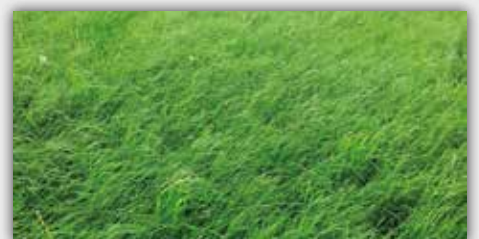
After Vredo (Day 31)